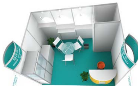
12sqm-Luxury Standard Package