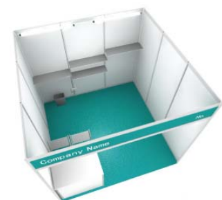
9sqm-Basic Standard Package