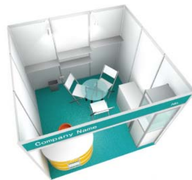
9sqm-Senior Standard Package

Basic package (min. 6sqm) Euro 40 per sqm Senior package (min. 6sqm) Euro 80 per sqm Luxury package (min. 12sqm) Euro 100 per sqm