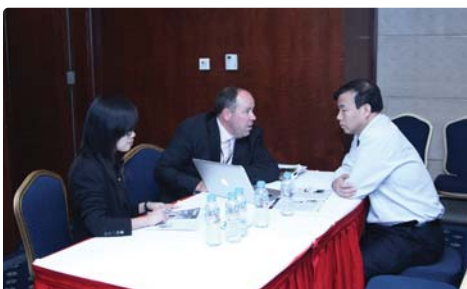
One-to-one Business Meeting