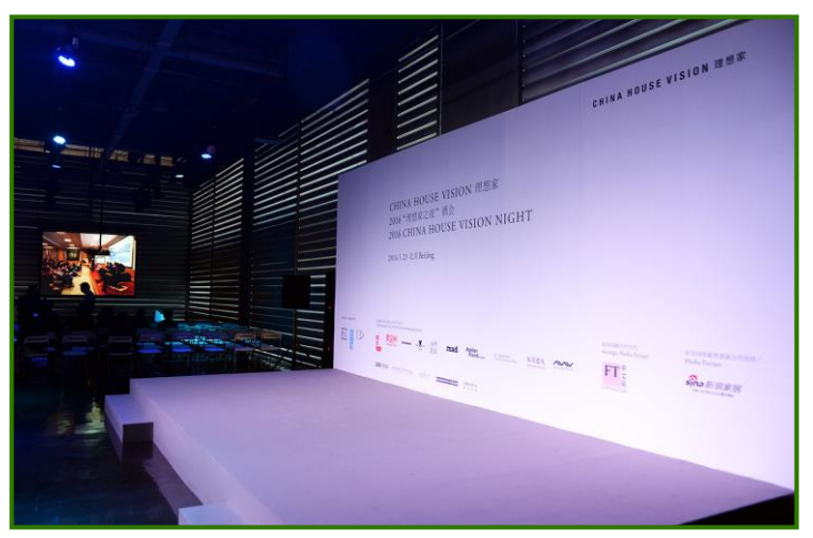
Brought to you by